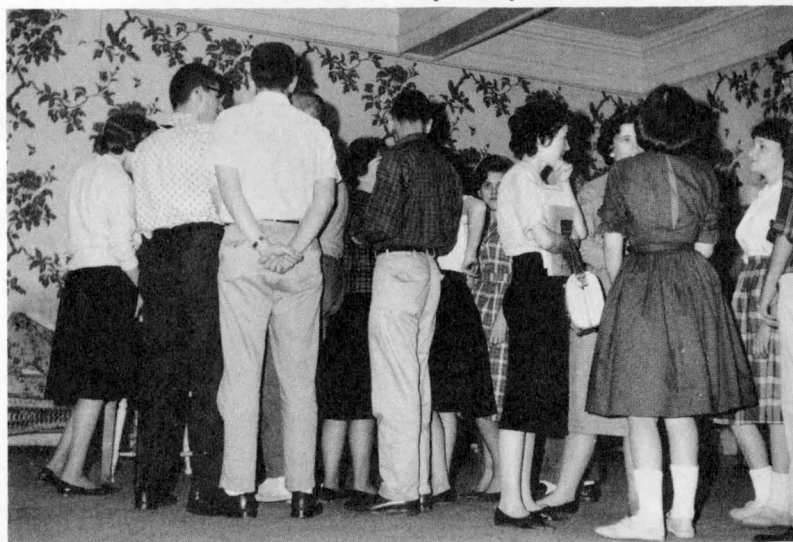
STUDENTS PRE-REGISTERING FOR the fall semester are a few of the 155 currently enrolled freshmen who intend to return next year. 340 additional applications have been received by MUNRC and 231 letters of acceptance have been mailed out. At present, no new students will be admitted unless they are in the upper 2/3's of their graduating class.

A fee of $15.00 per credit hour will be charged by the University and a facility fee of $3.00 per credit hour by the Normandy School District.